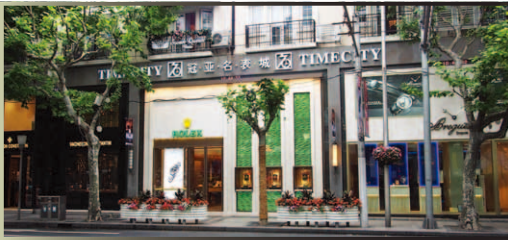
冠亞名表城 上海 南京西路 江詩丹頓、 勞力士、寶璣 專賣店 Timecity Shanghai Nanjing Road West Vacheron Constantin / Rolex / Breguet Boutique