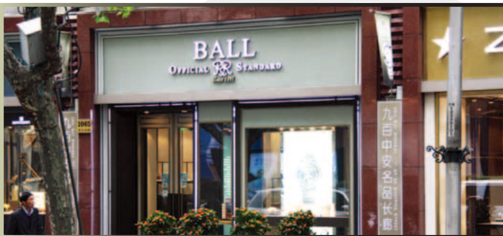
冠亞名表城 上海 南京西路 波爾 專賣店 Timecity Shanghai Nanjing Road West Ball Boutique